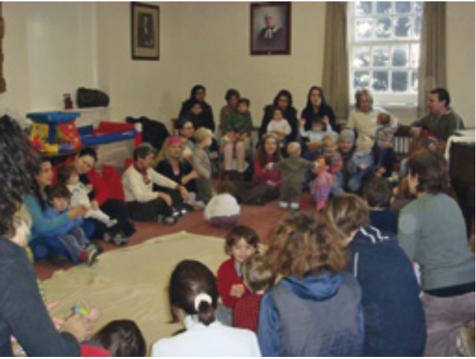
Toddlers group meets in the vestry