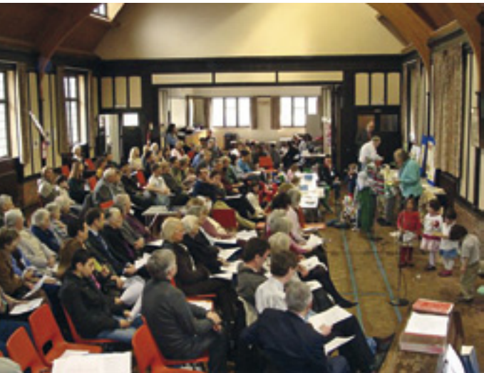
A childrens' service in the Hall

SUBURB NEWS IS PRODUCED AND DELIVERED TO YOU BY RESIDENTS ASSOCIATION VOLUNTEERS