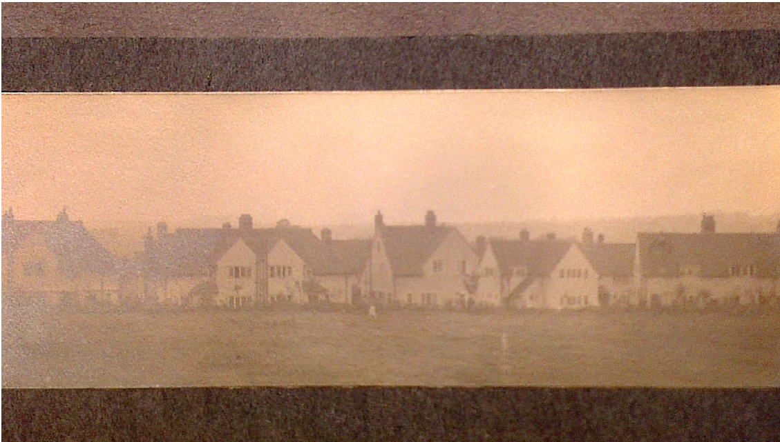
View of Willifield Way from North Square