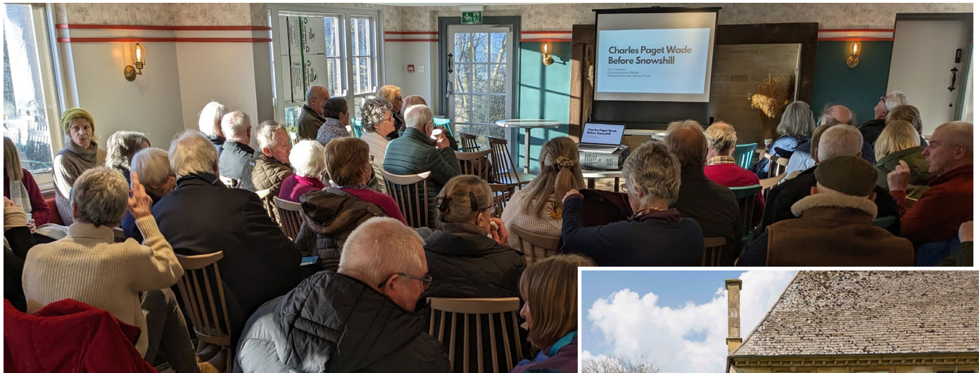
Above: The Trust Winter Lecture Below: The Great Wall; Inset: Snowhill Manor