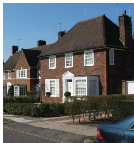
Clockwise from top: Erskine Hill (Lutyens, 1911); Gurney Drive (Hepworth, 1931) Corringham Road Square (Parker and Unwin, 1909)