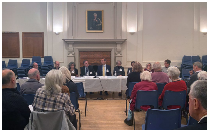
HGS Trust AGM at Henrietta Barnett School

Three candidates stood for the two positions, with a postal ballot deciding the outcome following the AGM. The votes were counted and verified by the Trust's auditors, Menzies LLP. 237 valid ballot papers were received, with nine rejected papers.