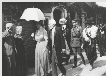
George Cadbury (centre, with Queen Mary), 1919, Bournville

Invitations for this Members' event will be sent out in the coming weeks.