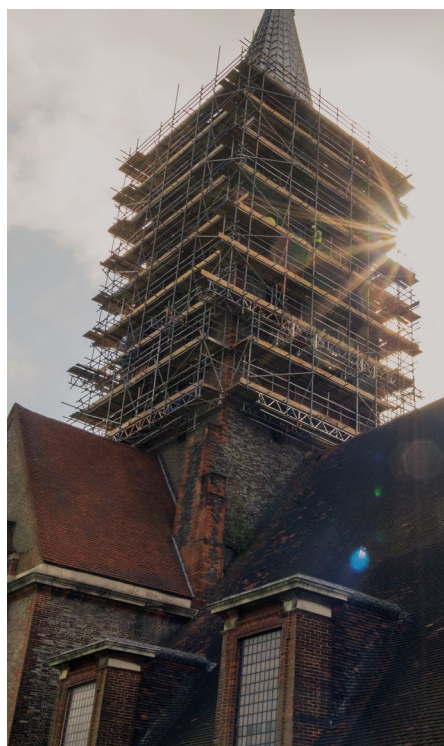
Scaffolding at St Jude-on-the-Hill