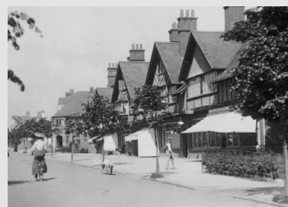
Shops in Sycamore Road, early 20th C, Bournville