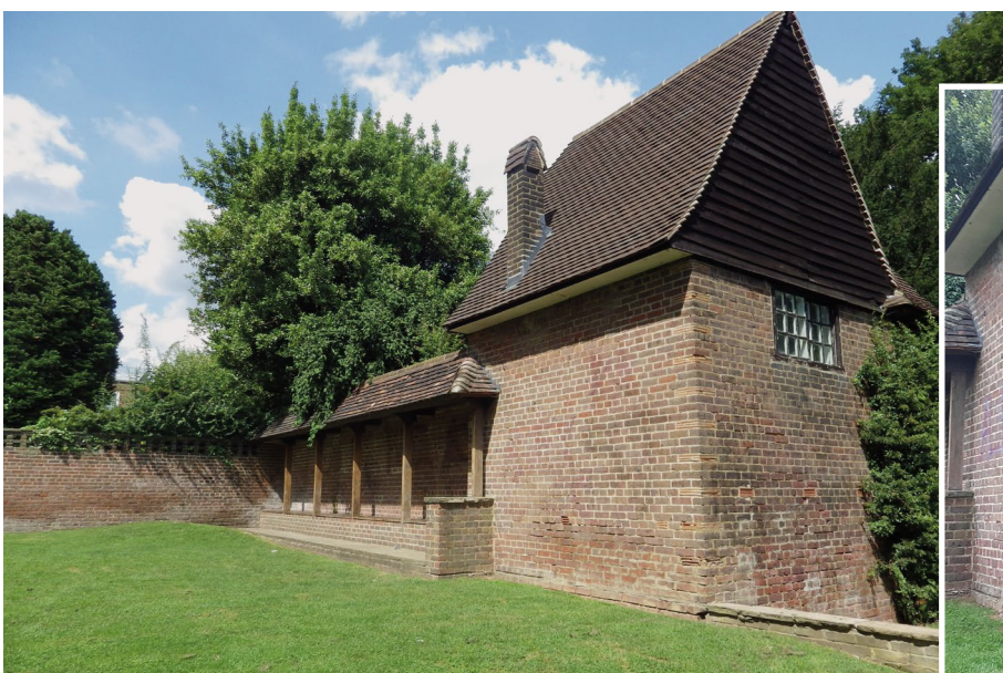
The Great Wall before and after cleaning

Please do let us know as soon as possible if you see any graffiti or other vandalism to Trust property, and we will take action.